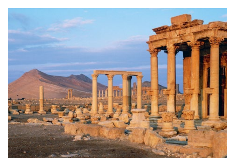
Global history has long ceased to be an exotic historiographical perspective. It represents a fundamental change in conceptualizing history as a whole. It discusses alternative models of periodization and alternatives to traditional constructions of historical spaces and identities.