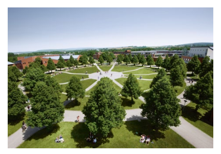
Nothing and no-one's too far away on our friendly campus. In contrast to larger universities, you'll get to know virtually all the faces on campus. Our rich campus life features regular film screenings, art exhibitions, theatre performances, music performances in the "Glashaus", our annual "Uni Open Air" Festival, and much more.

In addition, you will learn new approaches to cultural, economic, social, and political history, and benefit from a variety of subject areas that goes far beyond the classical, chronologically ordered subjects, such as History of Africa, Economic and Social History and Regional Franconian History .